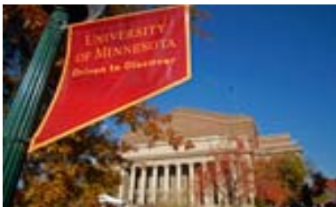
The University of Minnesota

Hennepin County Libraries initiated an evaluation of the longstanding program titled, “Homework Hub” with students from the University of Minnesota School of Social Work to collect data on how homework tutoring was being conducted at two different libraries. The information was used to redesign the tutoring system and integrate the best practices from each program into a new program, once the two systems merged.