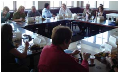
Hennepin County Cohort members discussing partnership ideas